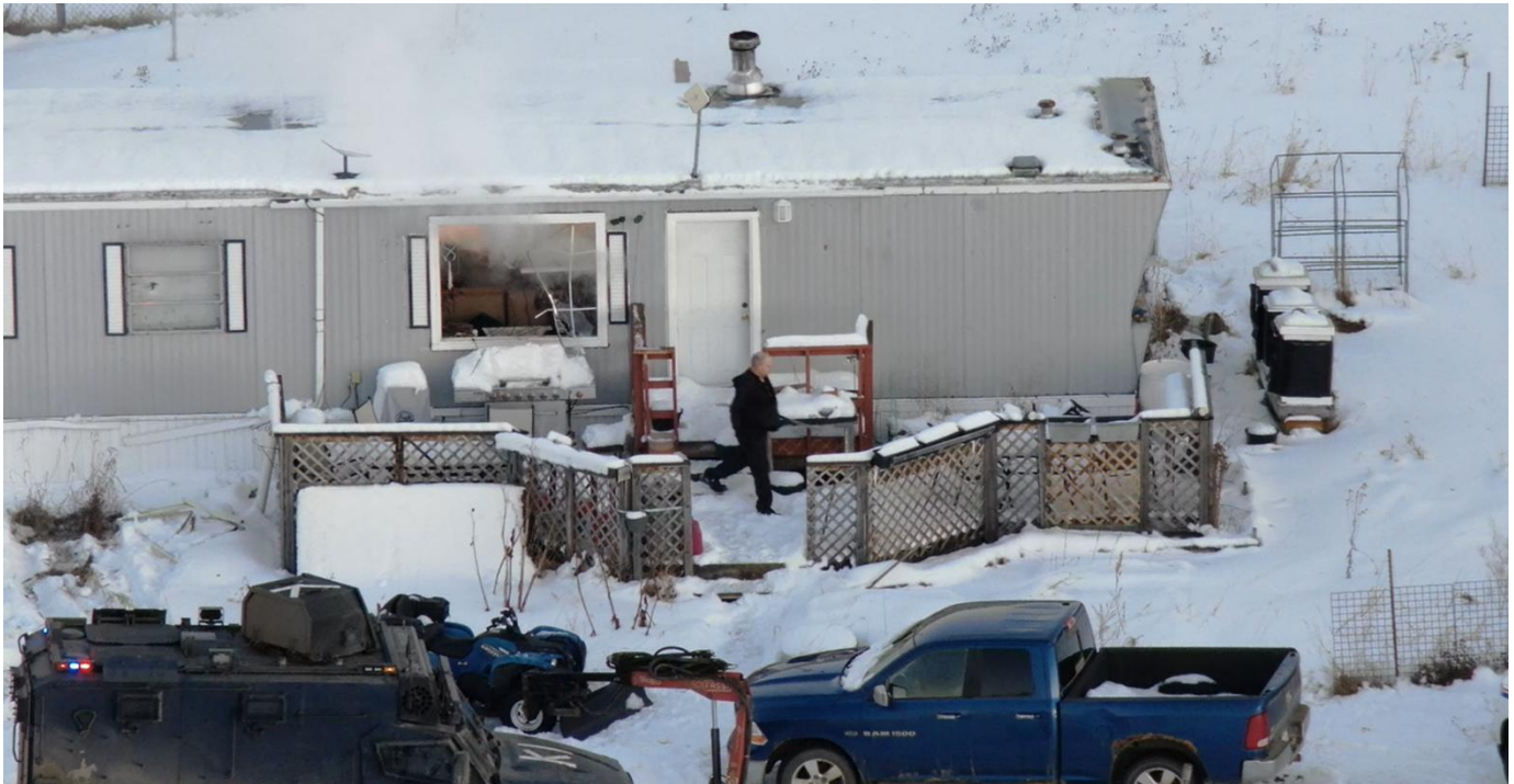
Figure 6 – The AP began walking away from his trailer still armed with an apparent handgun and a sword

thereafter with a less-lethal round striking the trailer to the left of the AP's head. The AP looked at the TAV for a moment and then briskly walked down the steps and turned to his left and began moving away from the trailer (Figure 6).