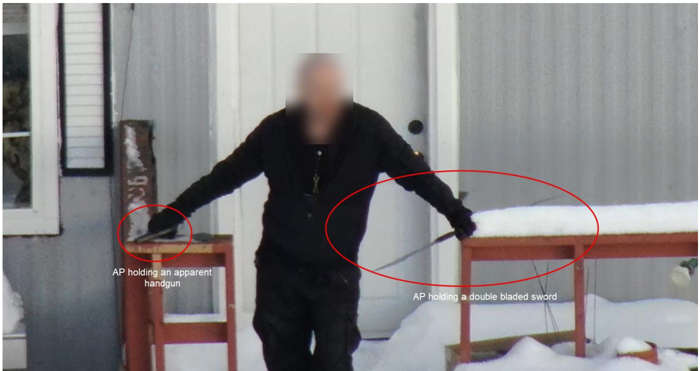
Figure 4 – The AP stood outside his residence holding an apparent gun and sword in each of his hands

The front door of the residence then opened. The AP dressed in black, exited the residence and closed the door behind him. The AP had a double-edged sword in his left hand. After standing outside for a moment, he reached behind his back and pulled out a pistol with his right hand. The AP stood at the top of the stairs with his hands to the sides both resting on the wood railing of the porch (Figure 4).