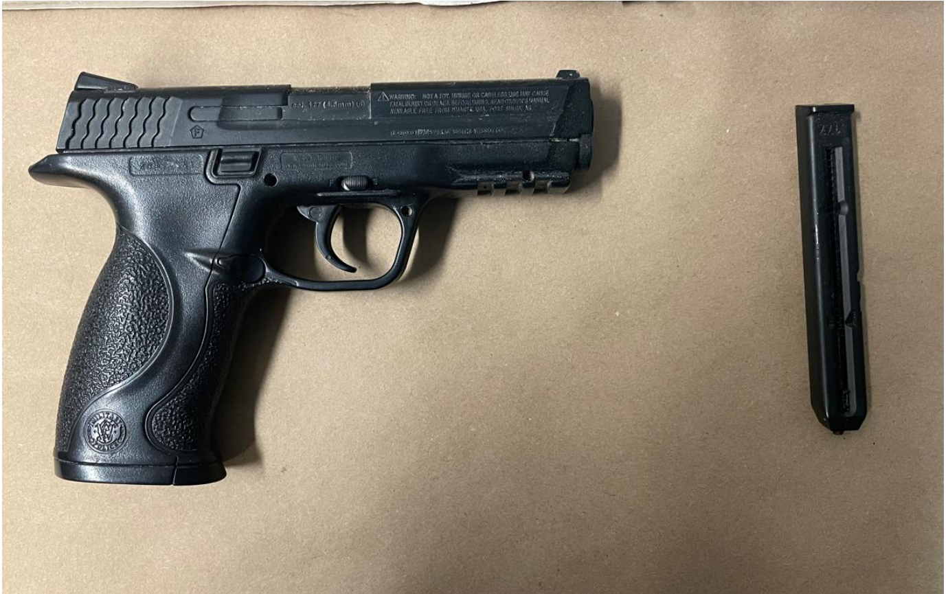
Figure 1 – The AP’s pellet gun.

A black pellet handgun and a long sword, which had a central handle with blades at opposite ends, were seized (Figures 1 and 2).