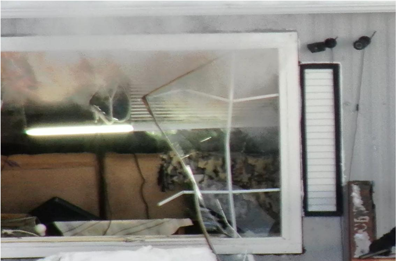
Figure 5 - Gas billowed out of the trailer's broken window

Gas smoke was observed billowing out of the broken window (Figure 5).