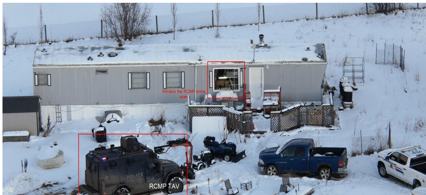
Figure 3 - TAV positioned in front of the AP's residence after breaking the trailer window. Both the TAV and window are identified by red squares.

The TAV approached the AP's residence and used its hydraulic arm to break out a front window (Figure 3).