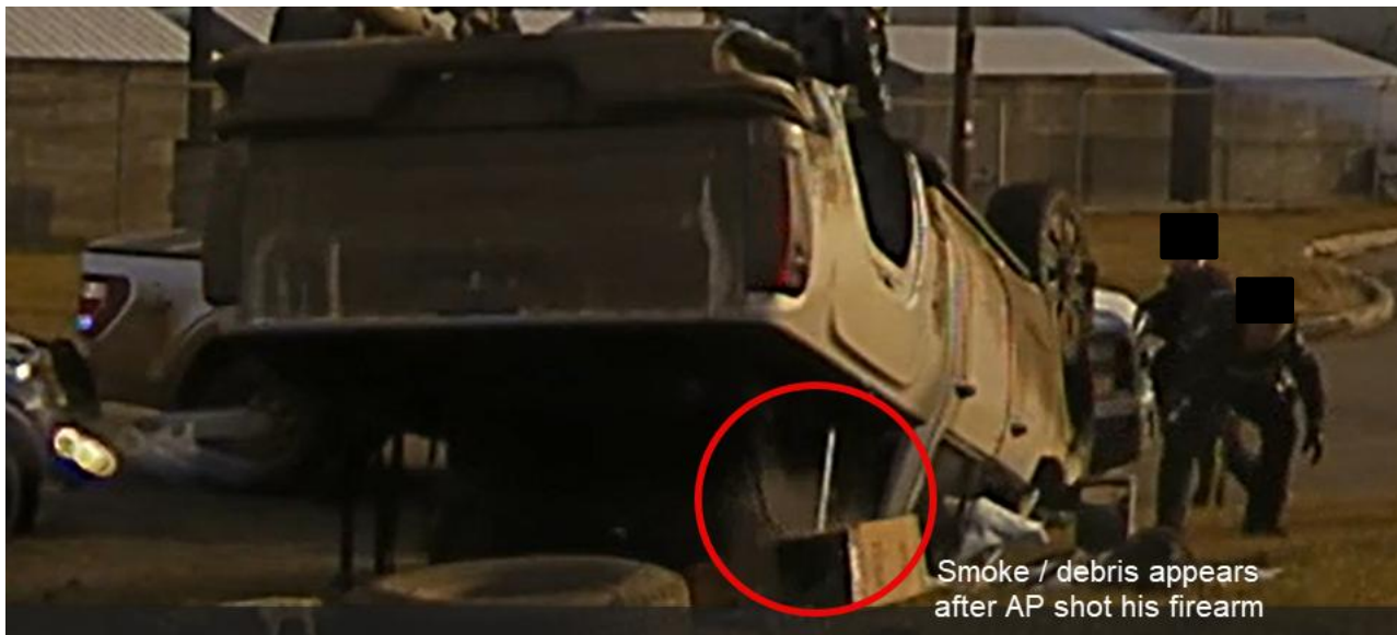
Figure 4 - Smoke / debris appearing after AP shot his firearm from within the truck.

vehicle and appeared to exit the rear of it (Figure 4).