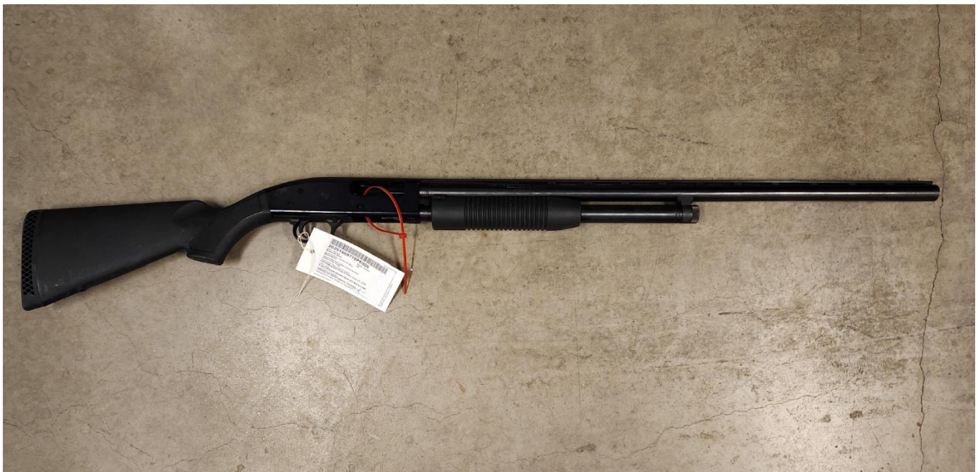
Figure 6 - Gun the AP possessed and fired during this event

The scene was in an industrial park area of Grande Prairie. The AP's truck was overturned. The truck had several bullet strikes in the interior, consistent with pistol rounds. The cover on the box of the truck had an apparent shotgun blast in it that appeared to originate from within the truck. As previously noted, a shotgun was observed inside the truck (Figure 6).