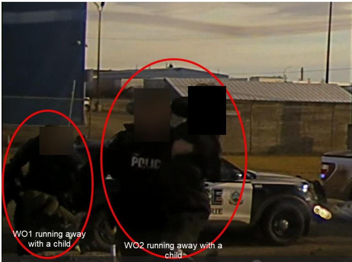
Figure 3 - Officers running away from the truck with children removed from it

WO2 backed away from the suspect vehicle yelling, "Gun, Gun, Gun!" The police officers around the vehicle backed away. WO1 reached into the rear passenger-side window and threw two children to safety. WO1 and WO2 each grabbed one of these children and ran away by the rear of the AP's vehicle (Figure 3).