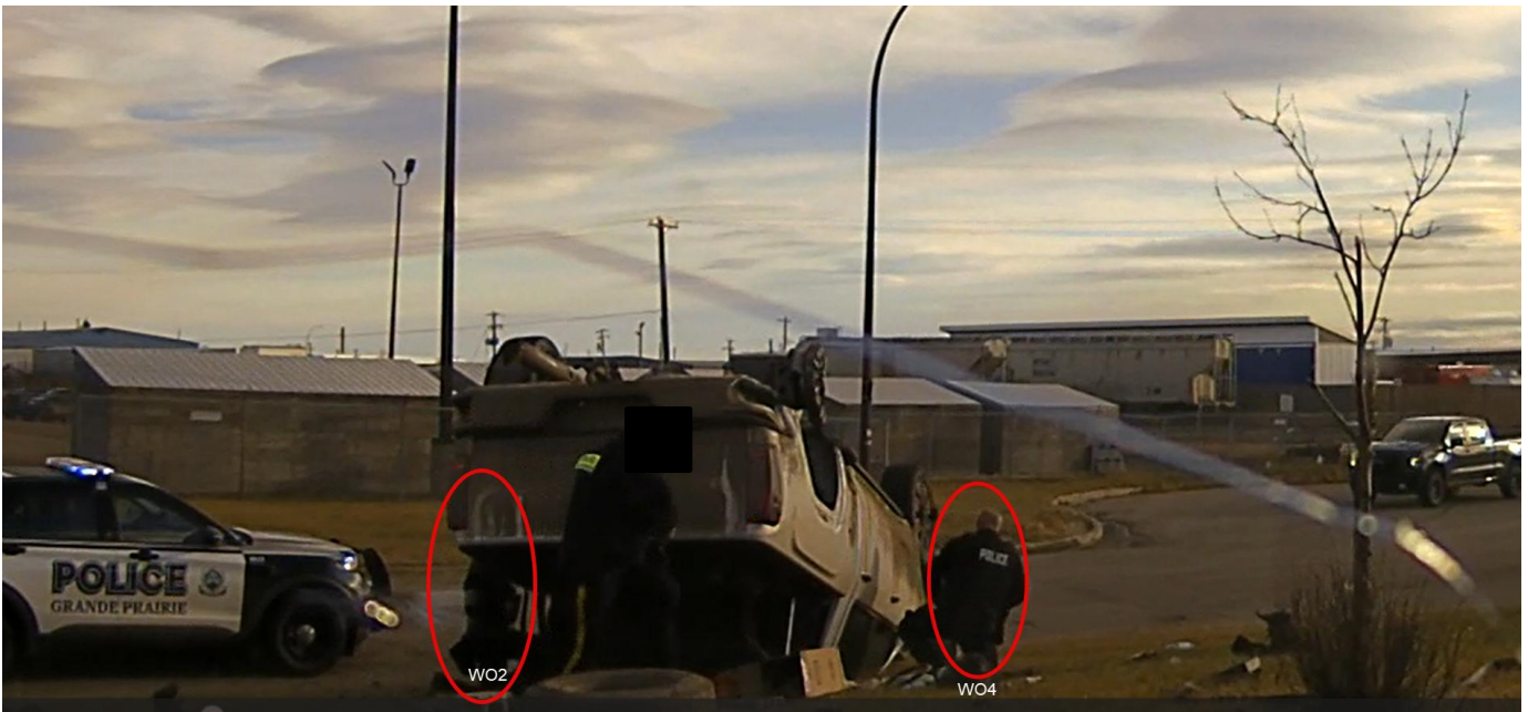
Figure 2 - Officers at the overturned truck.

WO1 parked in a business parking lot facing the upside-down suspect vehicle. From this viewpoint the rear of the suspect vehicle and the lead GPPS vehicle can be seen. Two GPPS officers and one RCMP officer were at the suspect vehicle, trying to get inside. WO1 exited his vehicle and walked to the AP's overturned vehicle (Figure 2).