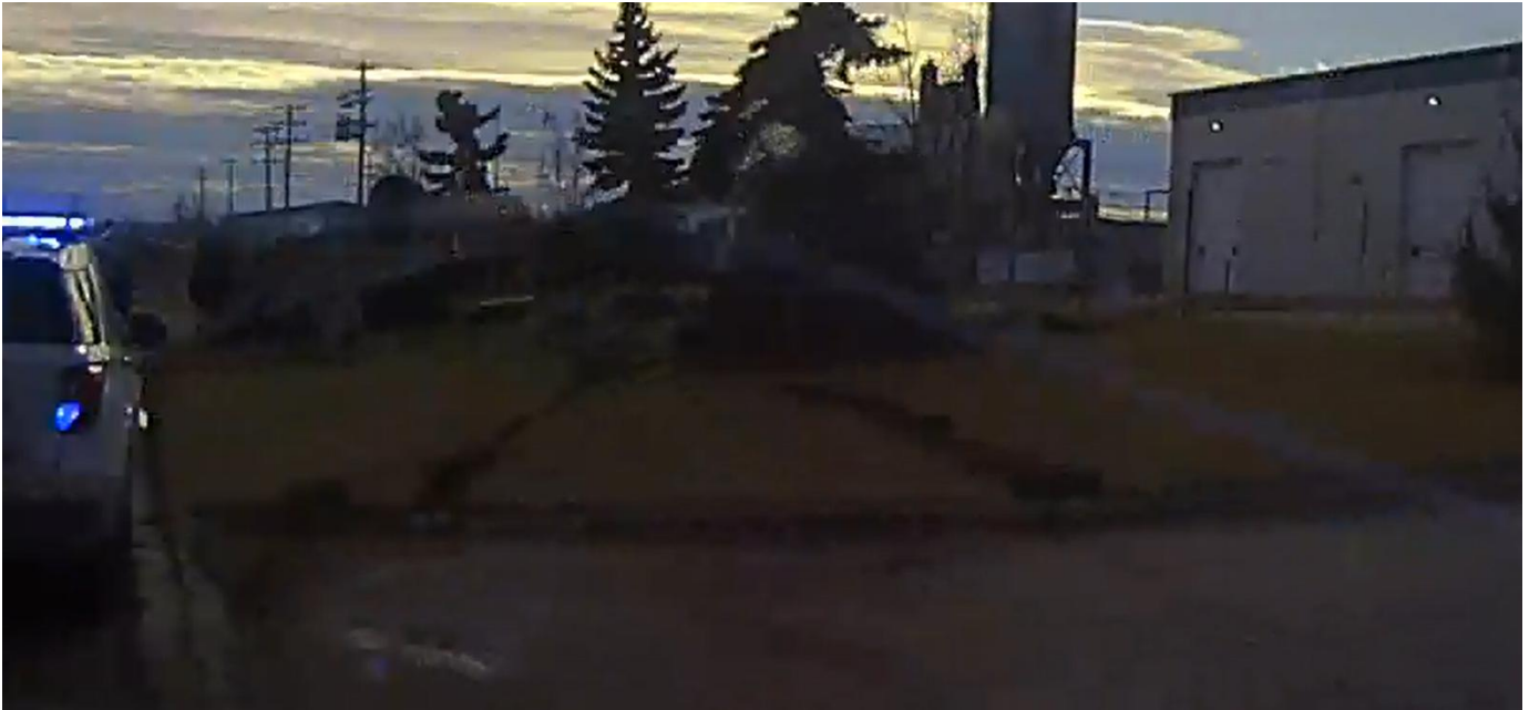
Figure 1 - Tire tracks showing where AP's vehicle left the roadway.

WO1 parked in a business parking lot facing the upside-down suspect vehicle. From this viewpoint the rear of the suspect vehicle and the lead GPPS vehicle can be seen. Two GPPS officers and one RCMP officer were at the suspect vehicle, trying to get inside. WO1 exited his vehicle and walked to the AP's overturned vehicle (Figure 2).