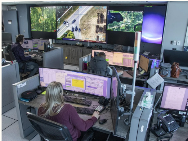
The Real Time Operations Centre (RTOC) at RCMP K-Division headquarters in Edmonton.